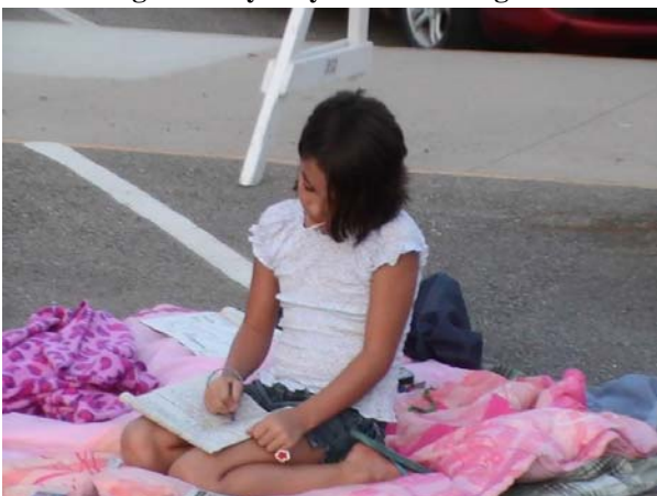
Elks gave away crayons & coloring books