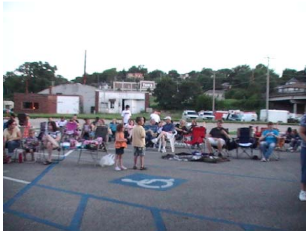
Crowd starting to come in, over 250 attended