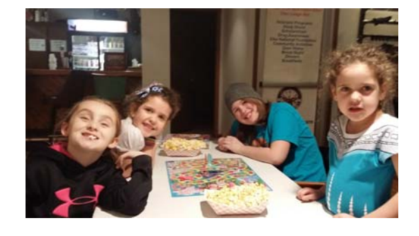
Family Game and fun night...Even the big KIDS got involved! Don't Miss the next one on February 26th!